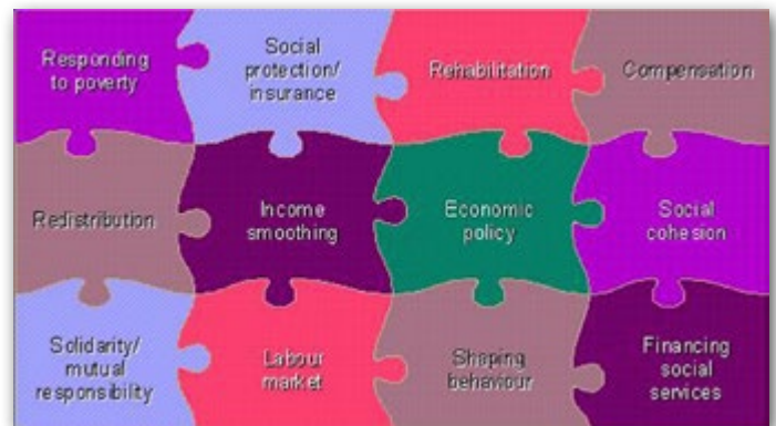
Figure 2: The aims of social security benefits

Benefits are paid for many different reasons. In How social security works, 2 I discuss some of the principal aims; Figure 2 lists many of them.